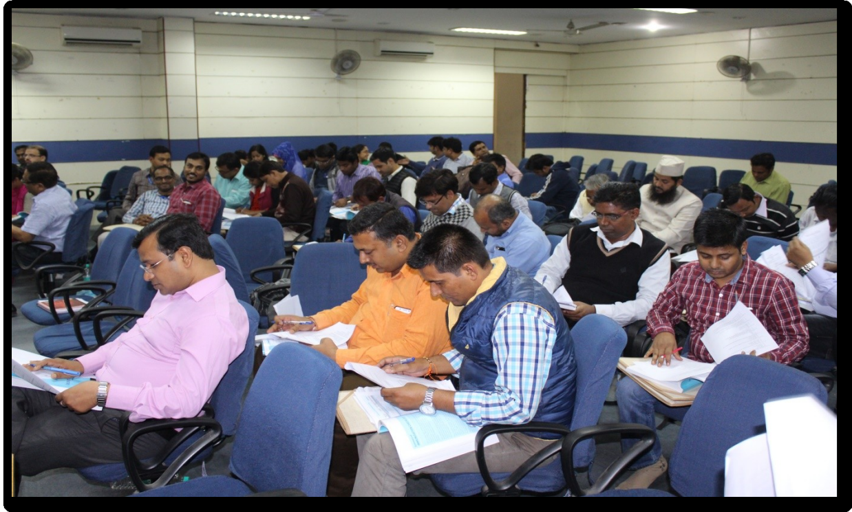
PARTICIPANTS DURING THE FINAL ASSESSMENT EVALUATION EXAM