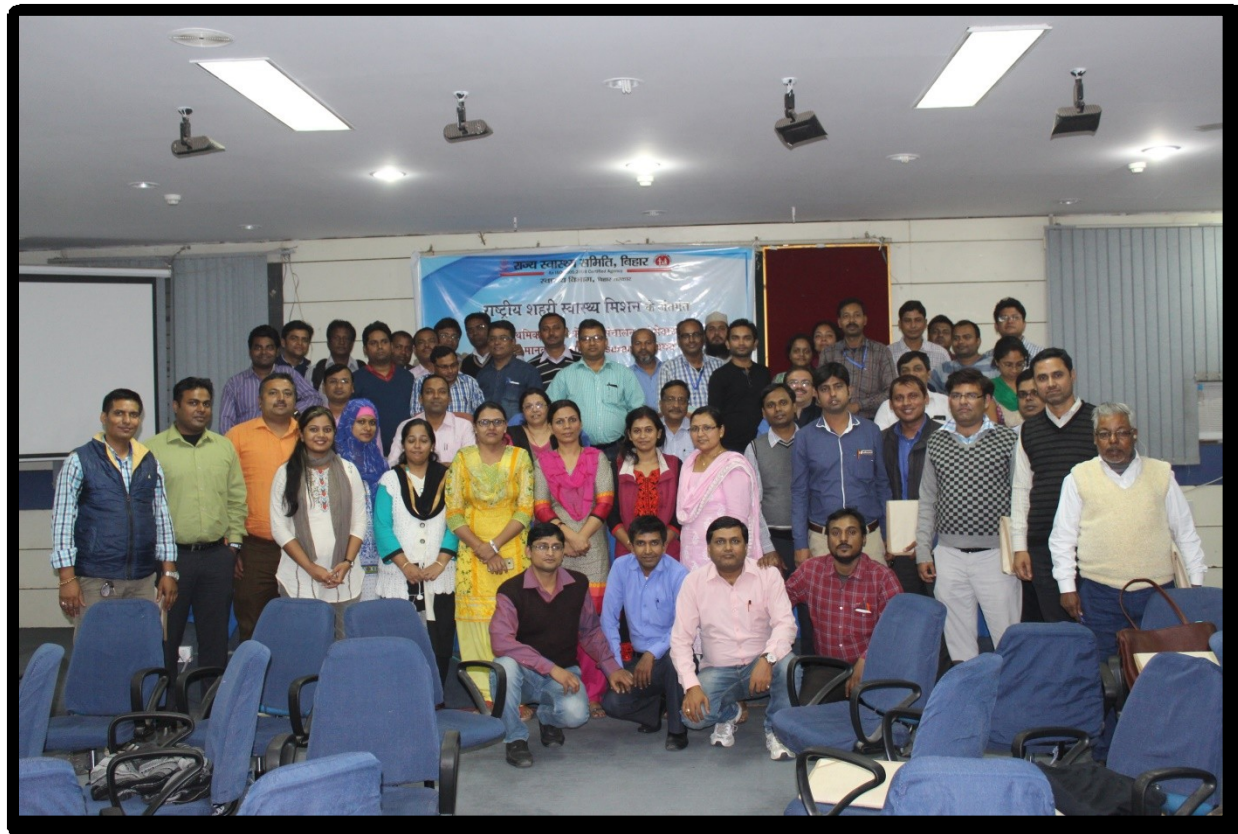
GROUP PHOTOGRAPH OF THE PARTICIPANTS AND THE TRAINERS.