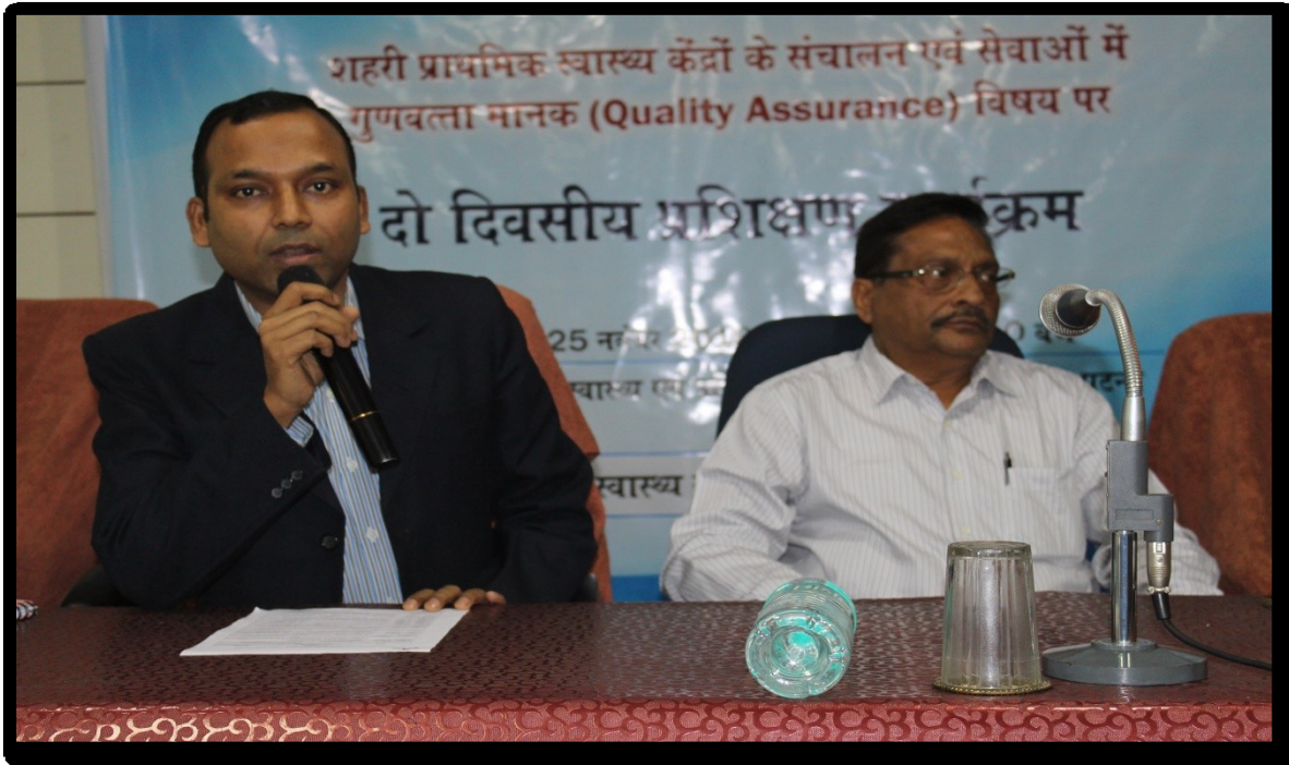
NODAL OFFICER NUHM GIVING THE OVERVIEW OF NUHM, BIHAR