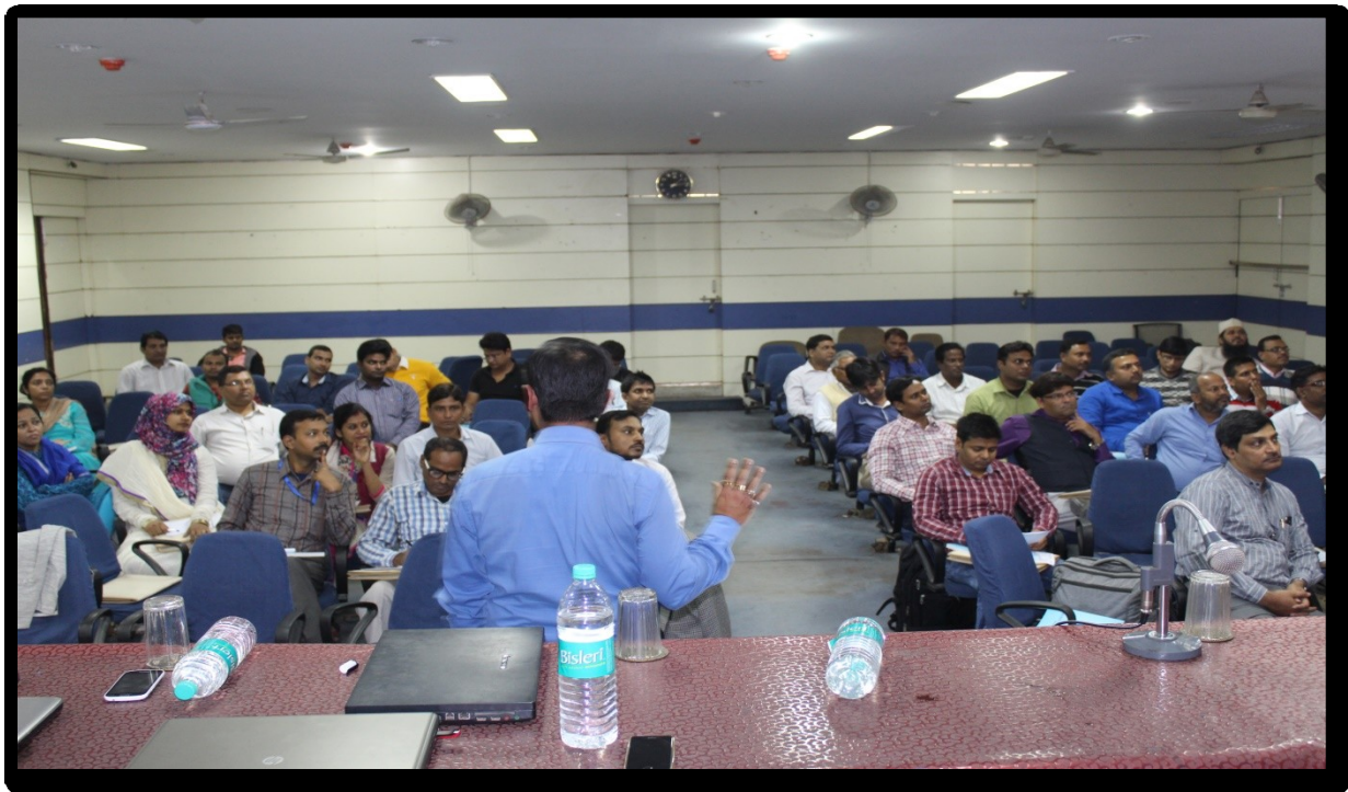
PARTICIPANTS DURING THE TRAINING SESSION.